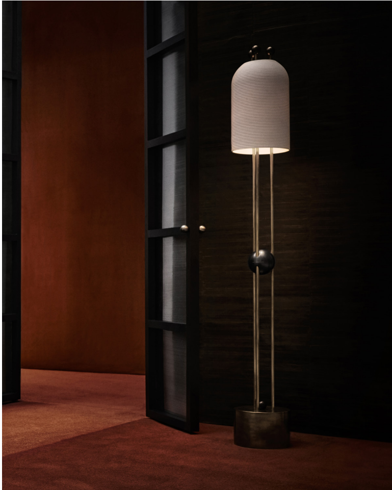
AGED BRASS / BLACKENED BRASS