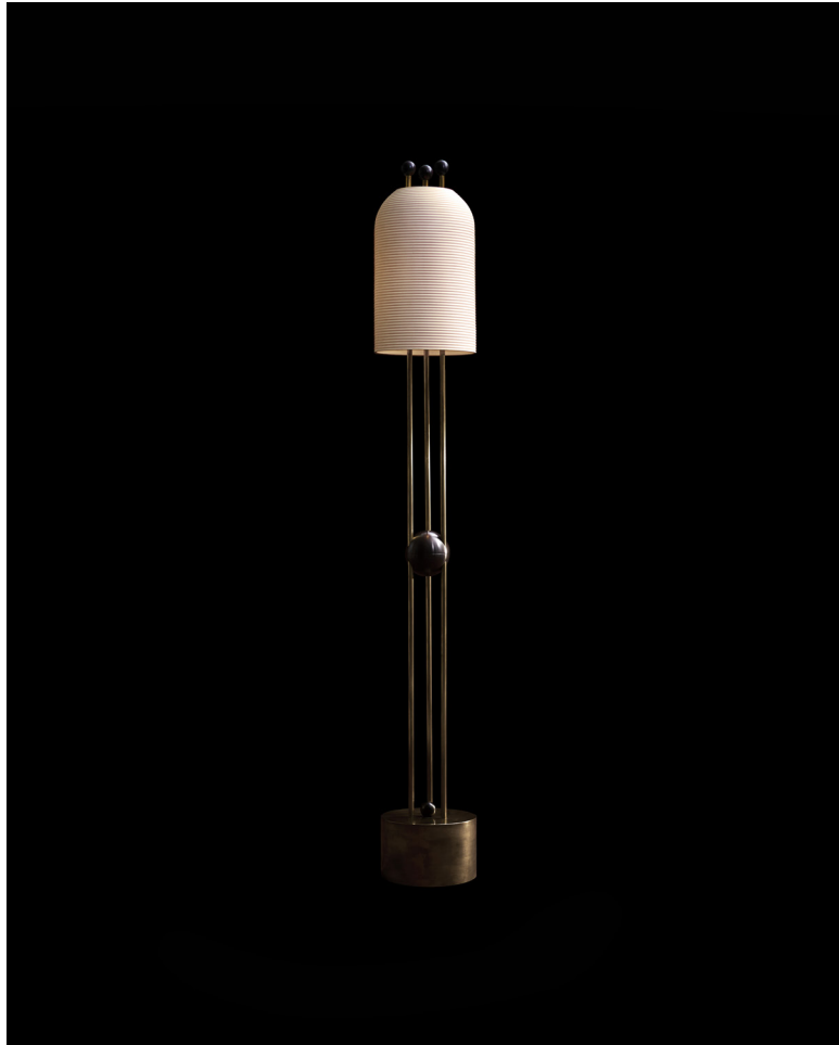
AGED BRASS / BLACKENED BRASS