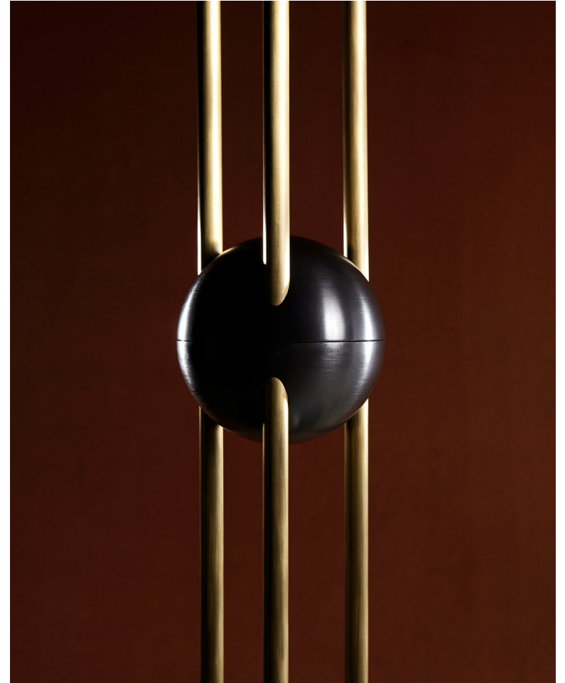
AGED BRASS / BLACKENED BRASS